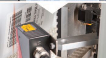
3-point scanning verification ensures order accuracy at the product, the invoice, and the shipping label