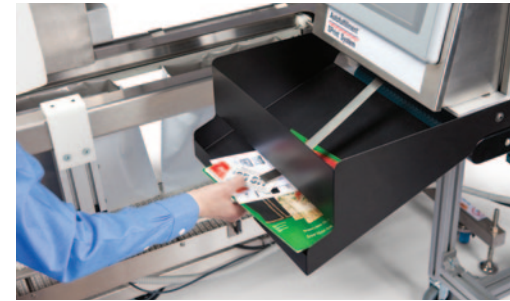
Optional collator delivers catalogs to the operator for inserting with the product