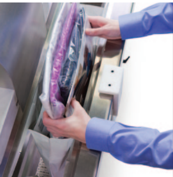
The unique box-like bag opening makes it easy to insert products

Autofulfillment™ SPrint™ System automatically labels, verifies and seals for fast and accurate order fulfillment