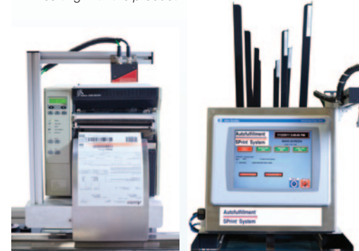
Optional inline printer produces and inserts invoices