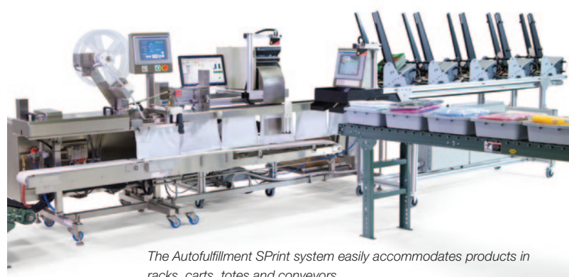
The Autofulfillment SPrint system easily accommodates products in racks, carts, totes and conveyors