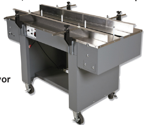
DLC-1854 Drop-Lug Conveyor

● Each application is different, and in many situations a separate Infeed Conveyor is needed to properly space your product to eliminate product jams. Some applications are calling for a Drop-Lug Indexing Conveyor, however in most cases a standard Belted Indexing Conveyor will suffice. SEAL-A-TRON offers standard self-contained Conveyors, that are controlled by the Automatic Sealer.