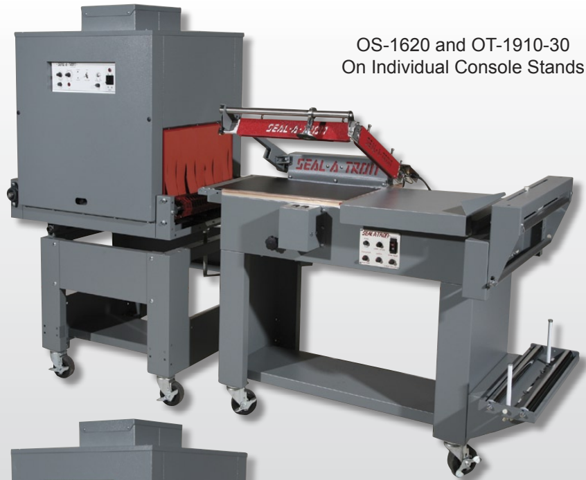
OS-1620 and OT-1910-30 On Individual Console Stands