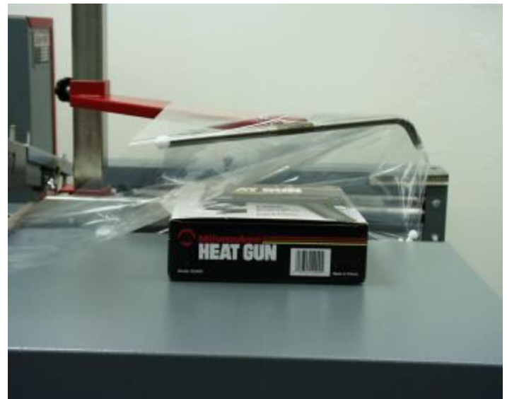
Universal Adjustable Inverting Head (Optional)

Kombi-Rapper™ is controlled by a completely programmable micro processor which can be fine tuned to accommodate even the toughest applications. This versatile system can easily be equipped with our 5' long exit conveyor to take even the lightest product away from the tunnel exit preventing product jams.