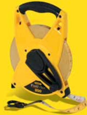
FatMax® Open Reel Fiberglass Long Tape