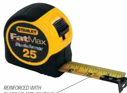
REINFORCED WITH BLADEARMOR™ COATING