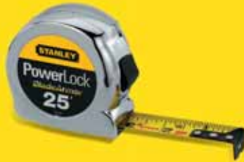
PowerLock® Tape Rule Reinforced with BladeArmor™ Coating