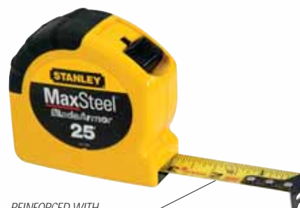
REINFORCED WITH BLADEARMOR™ COATING

Mylar® is a registered trademark of DuPont Teijin Films