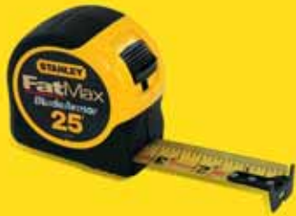
FatMax® Tape Rule Reinforced with BladeArmor™ Coating

Stanley's measuring innovation has established Stanley as a leading worldwide Tape Rule manufacturer. Our expanded line builds on this great heritage. For example, our new FatMax® Xtreme™ Tape Rules features 13' of blade standout, the longest in the world. We've also improved on classics by adding BladeArmor™ Coating to PowerLock® and MaxSteel® Tape Rules to extend the life of the blade. And that's only the beginning. Take a look at our tape line and see why after years of innovation, Stanley's Tape quality and durability are unmatched.