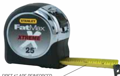
FIRST 6" ARE REINFORCED WITH BLADEARMOR™ COATING