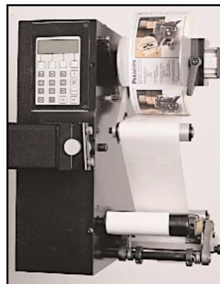
Easy access PLC controls

Plus, with Paragon's innovative modular design, a variety of applicator modules can be used to ensure the AccuSpeed continues to meet your needs as your pre-printed labeling needs change.