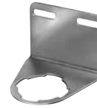
Regulator mounting bracket (Part No. P-71982).