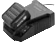
Rechargeable battery pack