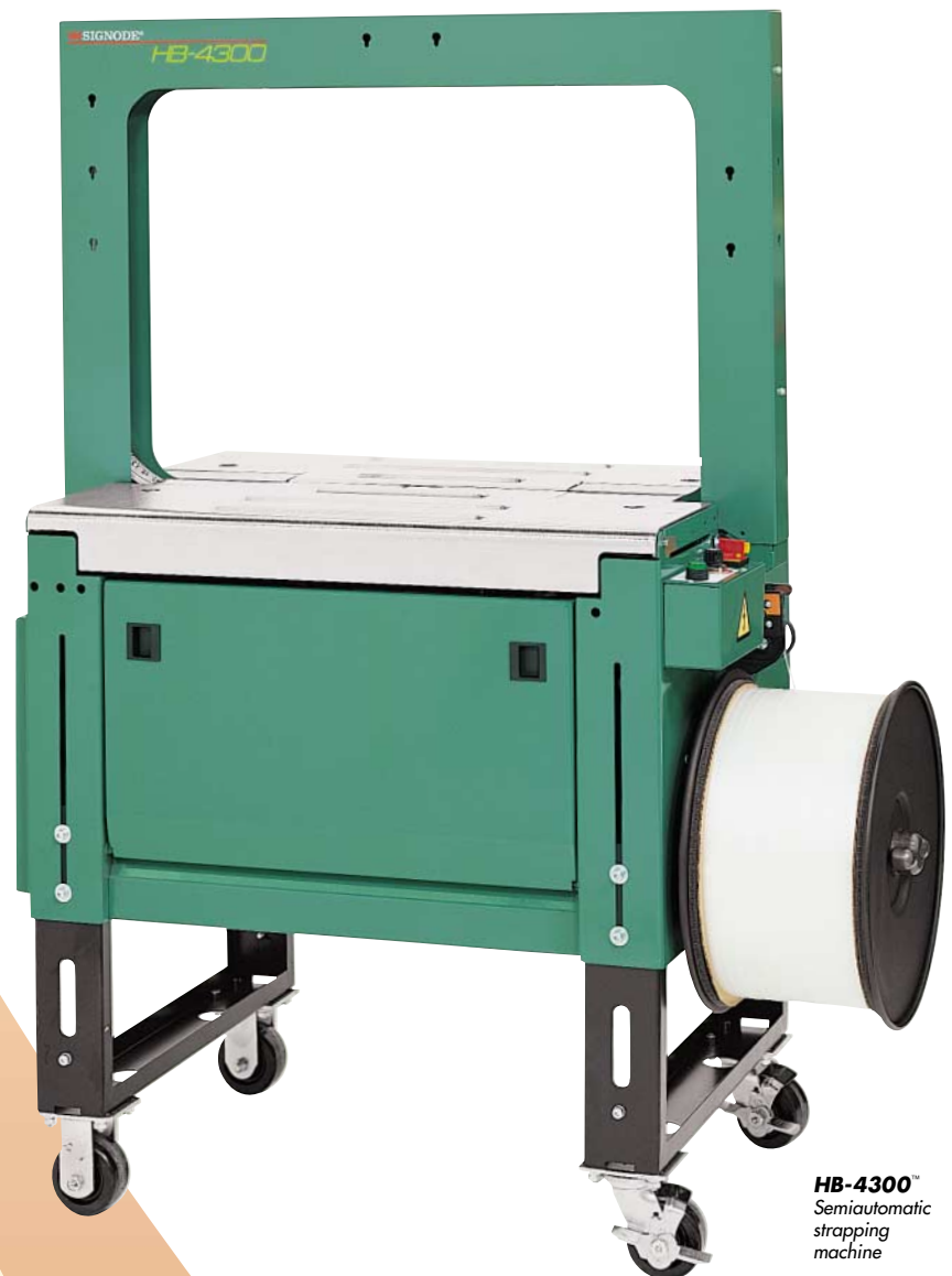
HB-4300™ Semiautomatic strapping machine